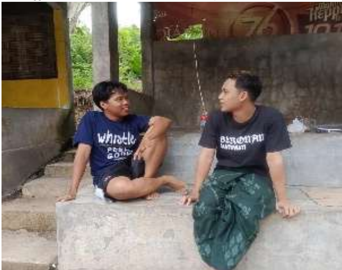
Figure 1: interviews with teenagers who dropped out of school.

The findings of the study related to the views of adolescents who drop out of school in Banjarejo Village reveal a complex emotional layer, especially related to the deep feelings of regret experienced by most of the research subjects in the field. They are fully aware that academic credentials are vital to guarantee a better future and unlock access to stable formal employment, yet they are squeezed by the urgent realities of the family economy and cannot be ignored in the slightest. Formal education is considered an ideal social mobility ladder, but the absence of costs becomes a barrier that cannot be penetrated by the financial condition of their parents who are all lacking. An informant said in a sad and regretful tone, "I actually wanted to graduate from elementary school, but my circumstances forced me not to continue formal education," said A. F., a teenager who dropped out of school (interview, March 26, 2026).