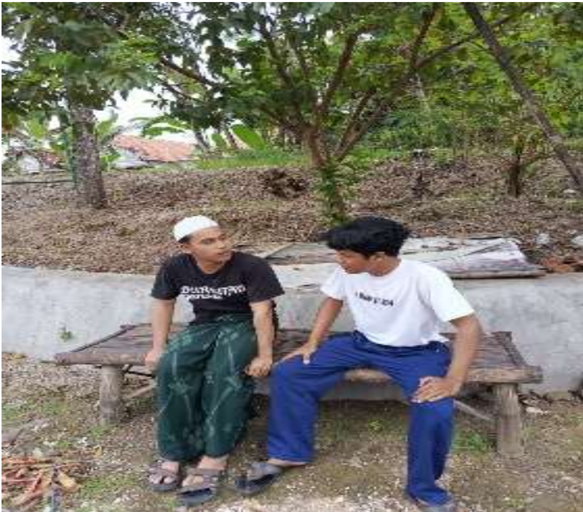
Figure 2: Interviews with teenagers who have dropped out of school.

illustrates the harsh reality where access to education is hampered by a solid wall of poverty and difficult to penetrate by ordinary family businesses. In addition, the inability to buy school supplies is also a specific reason that is often cited as an early trigger for despair for adolescents. Another informant added details of the burdensome cost burden, "Books and uniforms are difficult to buy, let alone transportation money to school every day," explained Informant 2. This data supports the finding that economic factors are not just verbal reasons, but real structural barriers that limit choice. Families in the Karangbinangun area are often at a subsistence level, so any expenditure on school must be carefully considered and often lost out by food needs. As a result, adolescents feel guilty if they continue to ask for school fees and choose to quit to ease the burden on their parents who have worked hard but still struggle to meet the basic needs of their extended families in villages with minimal formal employment.